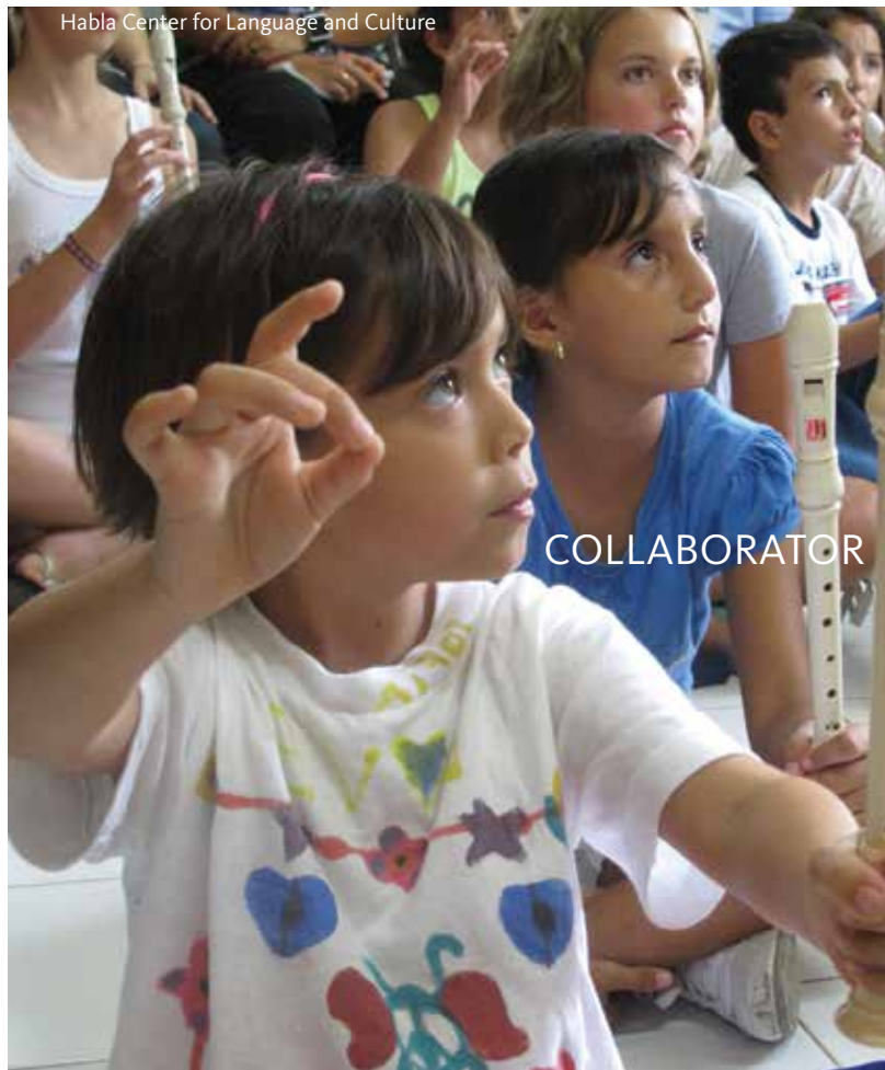
Habla Center for Language and Culture