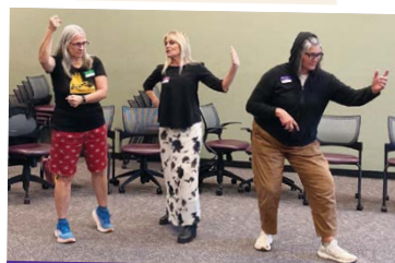
Elementary school teachers create a tableau of Cesar Chavez’s life during a professional learning workshop on arts integration.

In 2021, three K-8 Oroville area school districts proudly became the 28th site of the John F. Kennedy Center for the Performing Arts national arts education network with BCOE partnering as the backbone organization. The three school districts were selected by the Kennedy Center largely because they are rural and semi-rural with low socio-