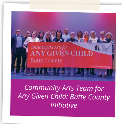
Community Arts Team for Any Given Child: Butte County Initiative

The goal of the project, called Ensuring the Arts for Every Given Child: Butte County Initiative , is to secure support among a broad variety of community sectors and to nurture new leadership. Through this collective impact approach we performed an extensive data survey of current arts education programs, and an attitudinal study of principals and teachers. Then we completed our strategic plan. We set up a network of teachers as champions for arts education; started a system to support experiences at arts venues with infographics of standards-based lessons; created a teacher guide at a local history museum in collaboration with Chico State's arts education program; and obtained a California Arts Council (CAC) grant to offer free artist residencies at