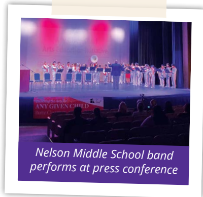
Nelson Middle School band performs at press conference

Any Given Child (AGC) schools. The initiative is steered by an implementation committee with the mission to advocate, promote, and connect to expand arts education in the districts.