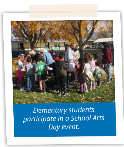
Elementary students participate in a School Arts Day event.

After-School Art Classes: ICOE and ICA, with additional support from the California Arts Council, are in their seventh year of offering a wide array of after-school arts classes in such subjects as oil and watercolor painting, ceramics, music (guitar), beading, caricature drawing, aboriginal dot art, and origami. These classes are taught by local artists and are presented at sites across the county, including schools for at-risk student populations.