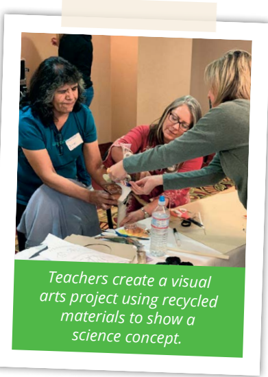
Teachers create a visual arts project using recycled materials to show a science concept.

emotional learning was central in planning the event. Educators left feeling refreshed to finish out the school year, inspired to make long-term arts planning part of what we do in rural education, and ready to use tools for integrating arts into many different subjects.