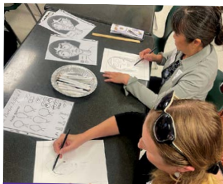
Inside Education members sketching their self-portraits as Tim Burton characters.

Each month, a select group of local community members hop on a bus for a fun and interactive field trip to explore Monterey County's classrooms and programs. Participants discover new possibilities in education and become better prepared to discuss, evaluate, and support our local schools. For the month of October 2023, the topic focused on Visual & Performing Arts. Participants had the opportunity to visit three local school sites: Gutierrez Middle School, Mission Park Elementary, and Alisal High School.