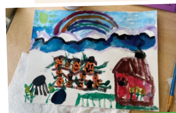
Mission Park students use water colors to express their artwork

Next, members went to visit Mission Park Elementary to engage in audio engineering and visual arts. Felix Diaz Contreras and Kenji Tanner worked closely with students to spark their curiosity and creativity. By providing digital/media art opportunities, students are able to express themselves in various mediums.