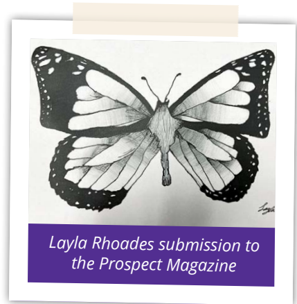
Layla Rhoades submission to the Prospect Magazine